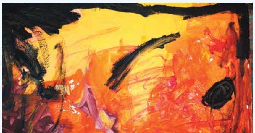
The artworks above were created by children from Noogaleek Children's Centre and Winnanggay Preschool.